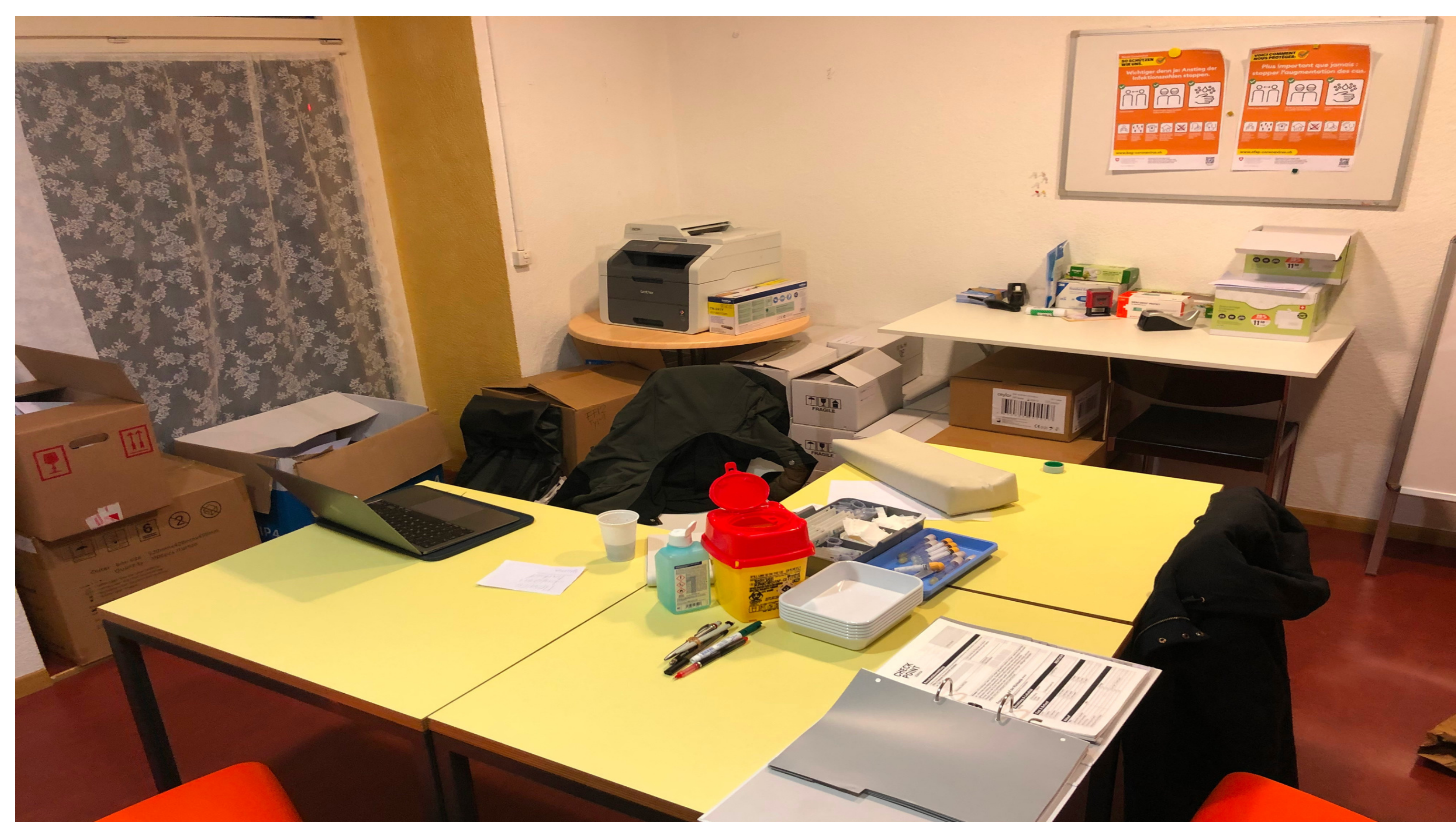
The night-café offers monthly walk in PrEP consultations for trans and male sex-workers with same-night PrEP start

Results: During the six events 23 participants were enrolled in the program. Fourteen were cis-male of whom all identified as either homo- or bisexual. Eight participants were trans-women and one was a cis-women. Ten participants were already using PrEP, but were doing so without medical supervision. Two out of 23 participants reported to never have had an HIV test taken before and two reported that their last HIV test was longer than twelve months ago. Thirteen out of 15 participants (87%) have taken up their follow-up appointment at a sexual health