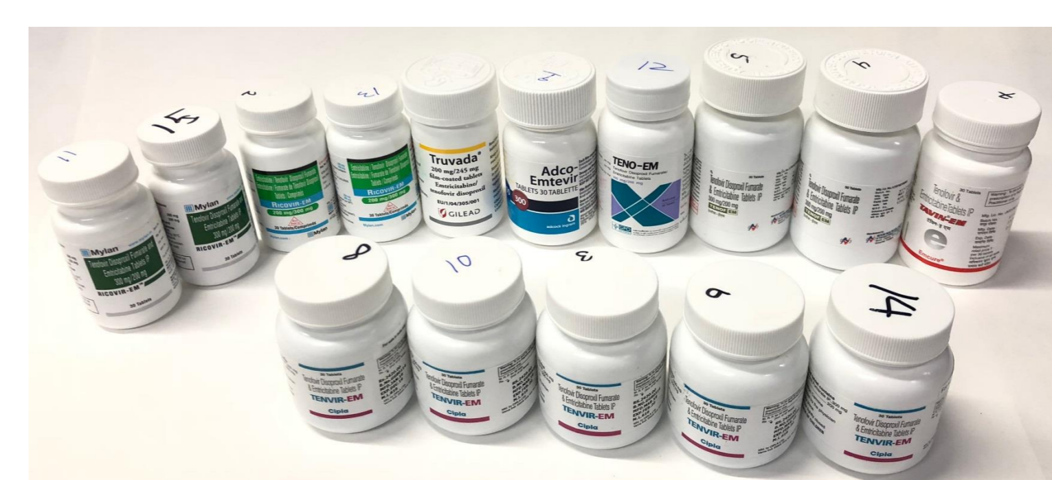
Bottle package of all the PrEP samples analysed in the study