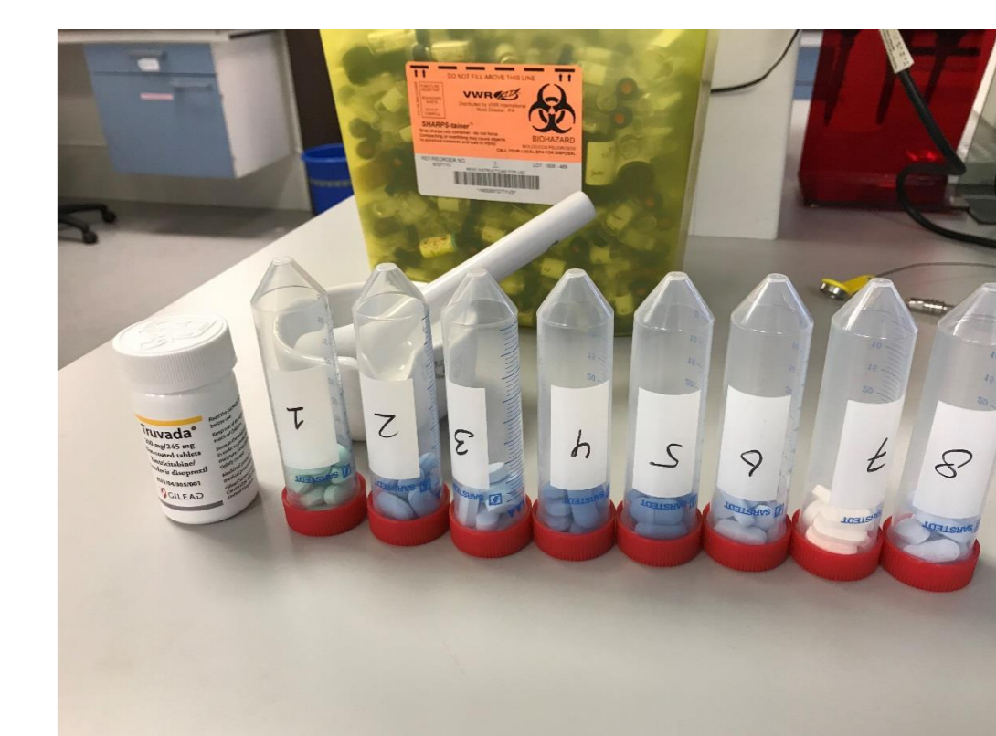
Blinded PrEP samples ready for processing