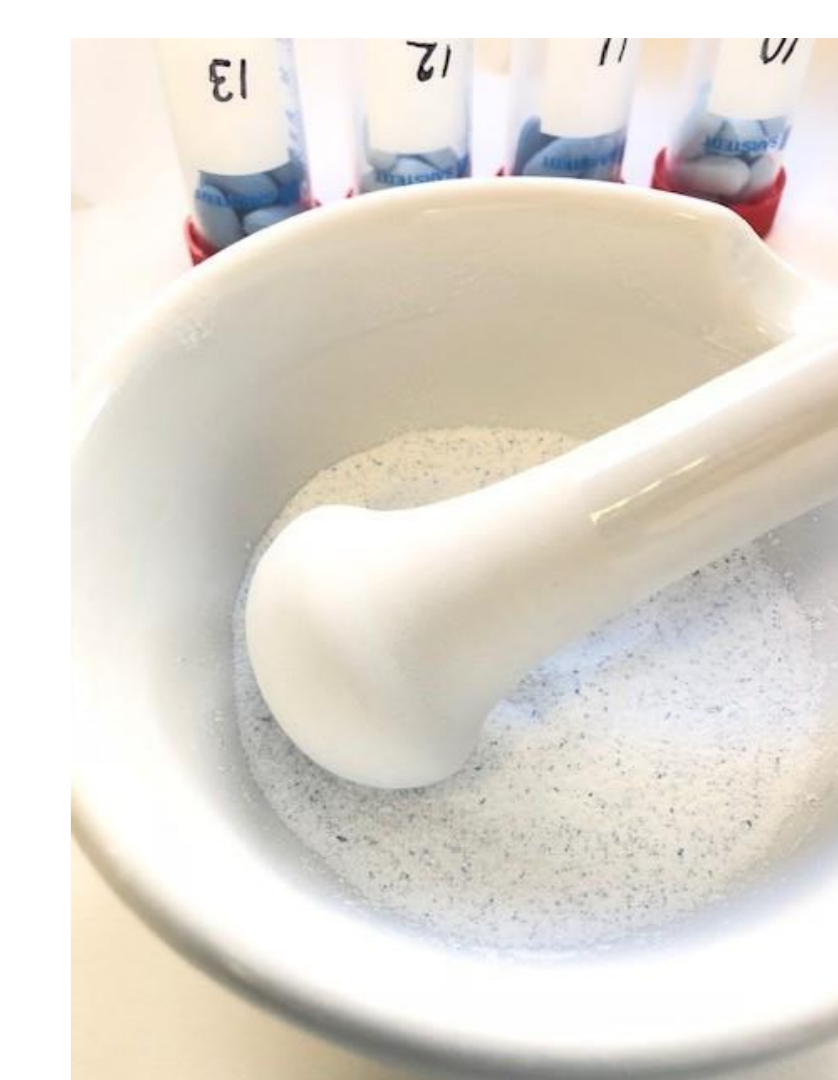
Fine powder ready to be dissolved in solvent